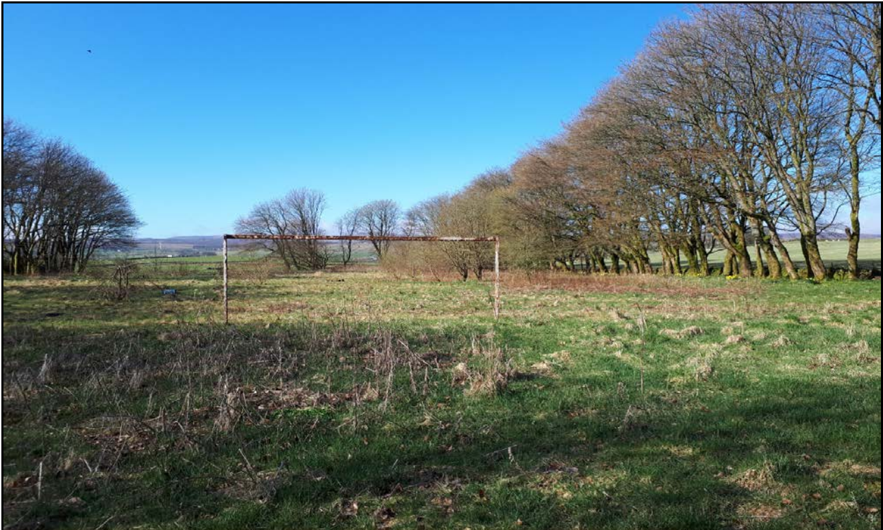
Photograph of former playing field taken in April 2020.